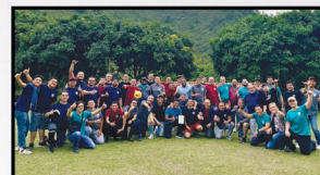
In March, 50+ men gathered for camp, striving to be men after God's own heart.