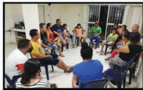
It's exciting to get photos like these, another adult Bible study being led by the men we trained.

Years ago, before we started the first church in Colombia, I asked God to give me one or two men to train for the ministry. Over these past seven years, he has called many more than I even asked for, and they have been faithful men. Our first churches are now running fully autonomously, and their leaders are even planning on how they can reach new areas with the Gospel. New Bible studies are being started, many times without our direct involvement. Some of the first generation of men we saw saved and trained are meeting with and training a new generation of preachers, who, in turn, will reach others. This multiplication process has been the goal since the beginning. I think only eternity will tell the total reach of this ministry. It is incredible to see and be able to participate in this work. Let us continue to be faithful in the process, and God will bring the fruit.