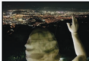
The "Santisimo" is a large statue of Jesus that overlooks our city. We look forward to the day Colombia can know the real Jesus!

I mentioned in our last letter that we would be assuming leadership of a small nearby congregation. Right after we sent out that update, it seems that everything fell through, at least for now. The meeting place, the logistics, and even the people's will seemed to all fall apart. It may have been because of the Christmas season, but we will see. Pray that God gives us wisdom in how, or if, we should proceed.