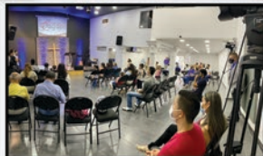
This new church would not have been started, were it not for COVID!

Our most recent church, Ágape Baptist Church, has continued to grow since its inception in November. We have seen new people attend weekly, and many are finally understanding the Gospel for the first time. Even last week, we were able to baptize three men who recently believed in Christ for salvation. We have around 30 adults attending a new members class this month, preparing to join us as we officially organize as a church in March. I am thrilled at how the Lord is building his church, and he is allowing us to have a small part. Thank you, again, to those who have prayed for and given specifically to this new work.