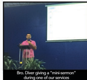
Bro. Diver giving a "mini-sermon" during one of our services